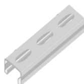
Structure & Rail